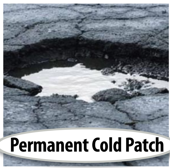
Permanent Cold Patch